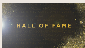
Hall of Fame