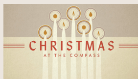
Christmas at The Compass