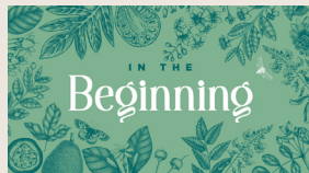
In The Beginning

In Ministry Year 2025, we came together for relevant Bible teaching across all our locations during these 12 sermon series.