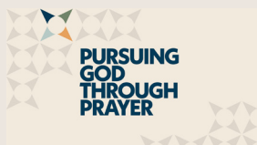
Pursuing God Through Prayer