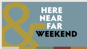
Here, Near & Far Weekend