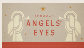
Through Angels' Eyes