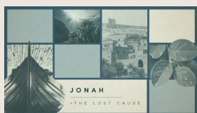
Jonah and the Lost Cause