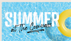
Summer at The Compass