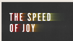
The Speed of Joy