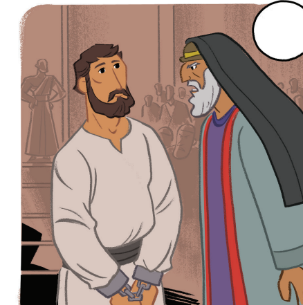
PILATE HANDED OVER JESUS TO THE CROWD TO BE CRUCIFIED.