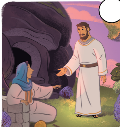
ON THE THIRD DAY, JESUS ROSE FROM THE DEAD.