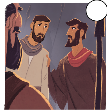
A CROWD GRABBED JESUS AND ARRESTED HIM.