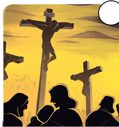
SOLDIERS NAILED JESUS TO A CROSS. HE DIED.

Number the events in the order they happened.