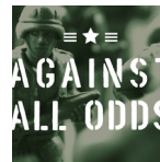
Against All Odds