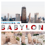
Thriving in Babylon

In Ministry Year 2019, we came together for discipleship across all of our campuses under these nine sermon series.