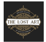
The Lost Art