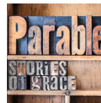
Parables: Stories of Grace